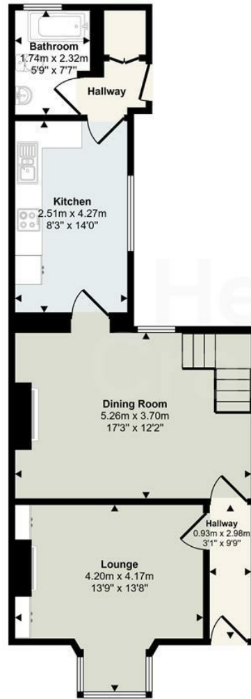
Ground Floor Approx 57 sq m / 618 sq ft