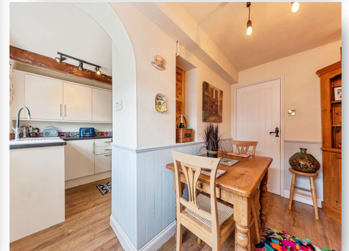
Main Street, Balderton Newark NG24 3NN