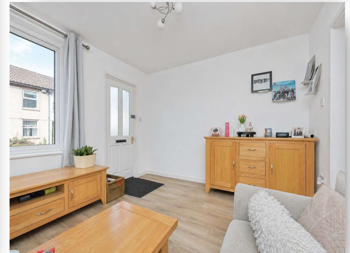
Gladstone Street, Norwich NR2 3BJ