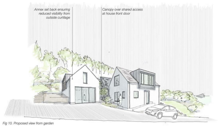
Fig 10. Proposed view from garden