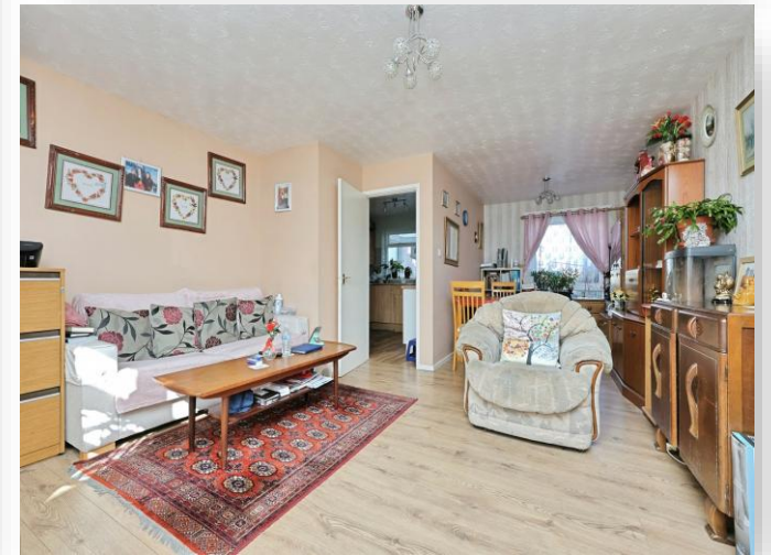
Woodside Road, Norwich, NR7 9HF