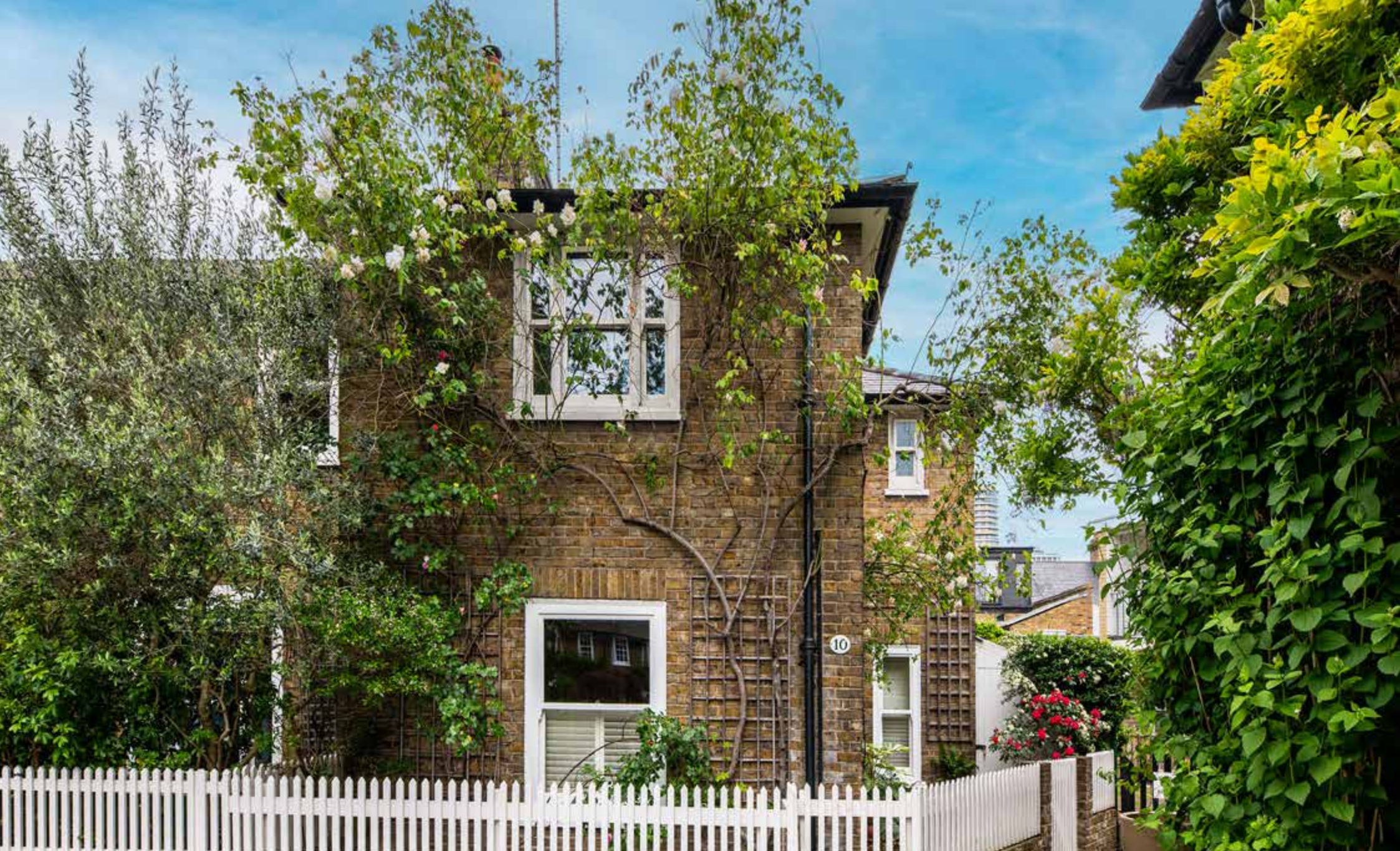
Avondale Park Gardens, W11