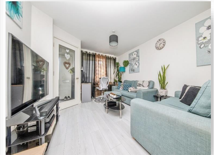
Jade Gardens, Colchester, CO4 5FG