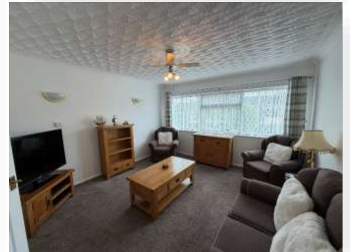
Westfield Road, Yaxley Peterborough PE7 3LG