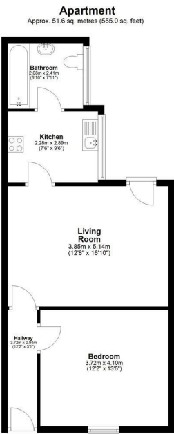
Total area: approx. 51.6 sq. metres (555.0 sq. feet) 27a Montpelier