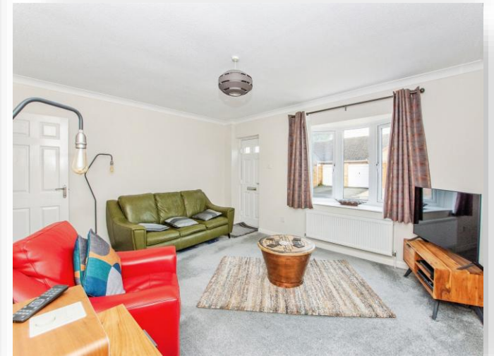
Donington Park, Leverington Wisbech PE13 5EF