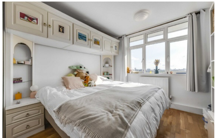
Notting Hill Gate, W11