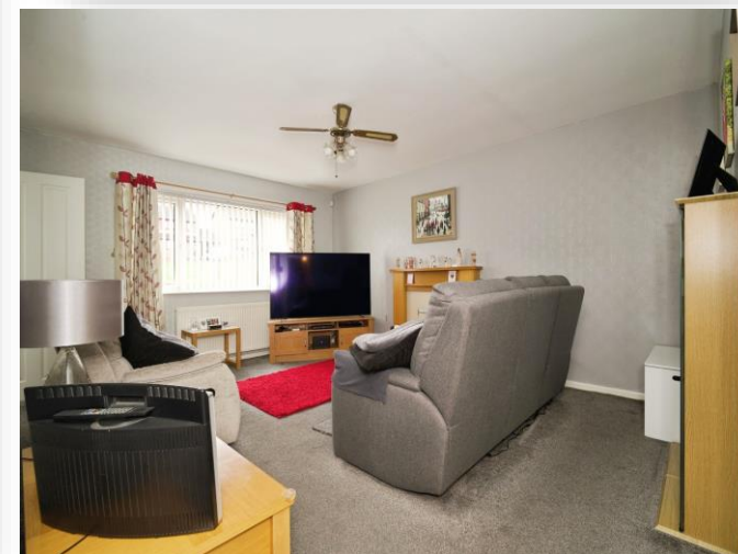
Sandalwood Rise, Swinton MEXBOROUGH S64 8PN