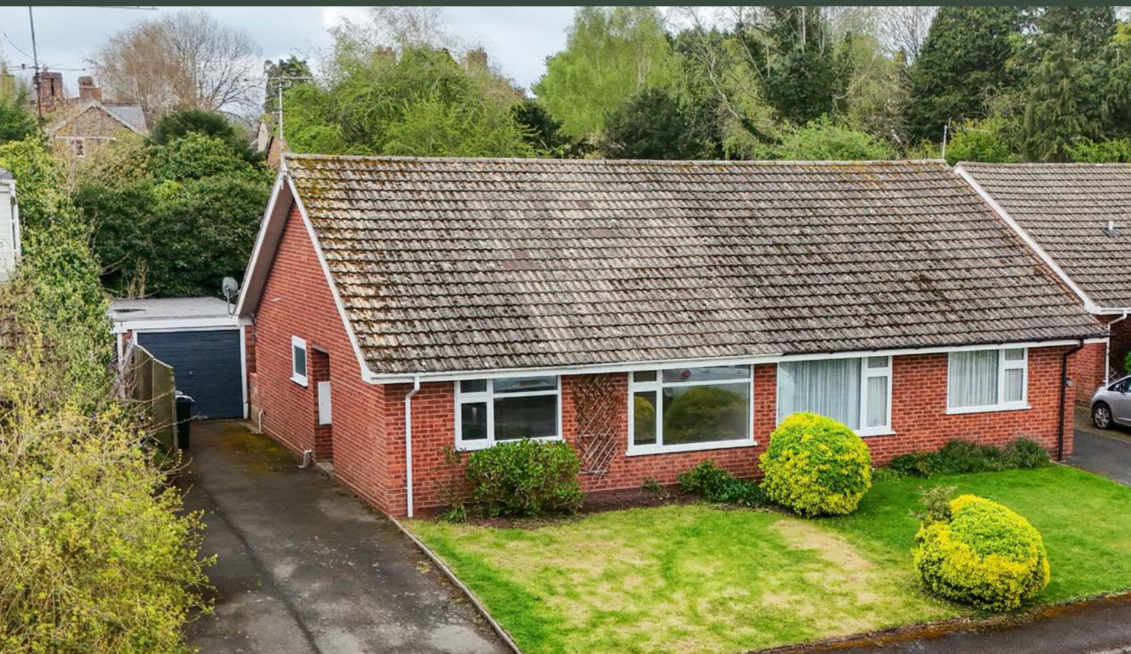
9 Kenelm Close, Clifton upon Teme, Worcestershire, WR6 6EB