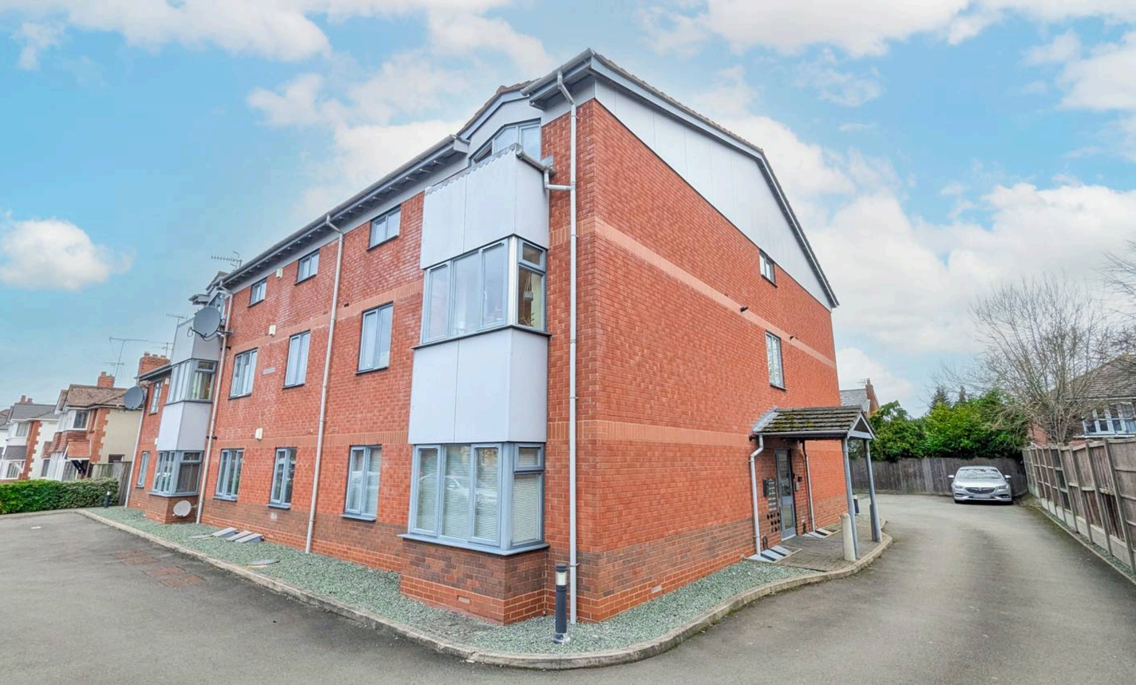
Pinewood House Coombs Road, Worcester – WR3 7HW £125,000