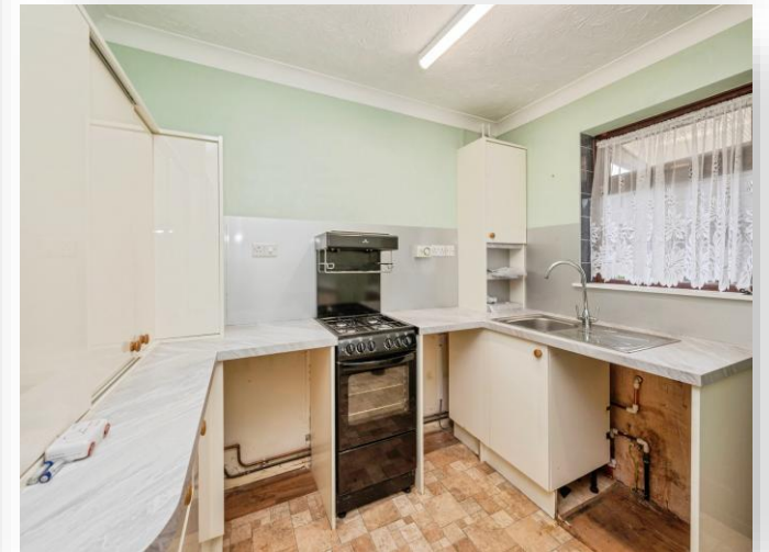
Lancaster Gardens, Aylsham, Norwich, NR11 6LD