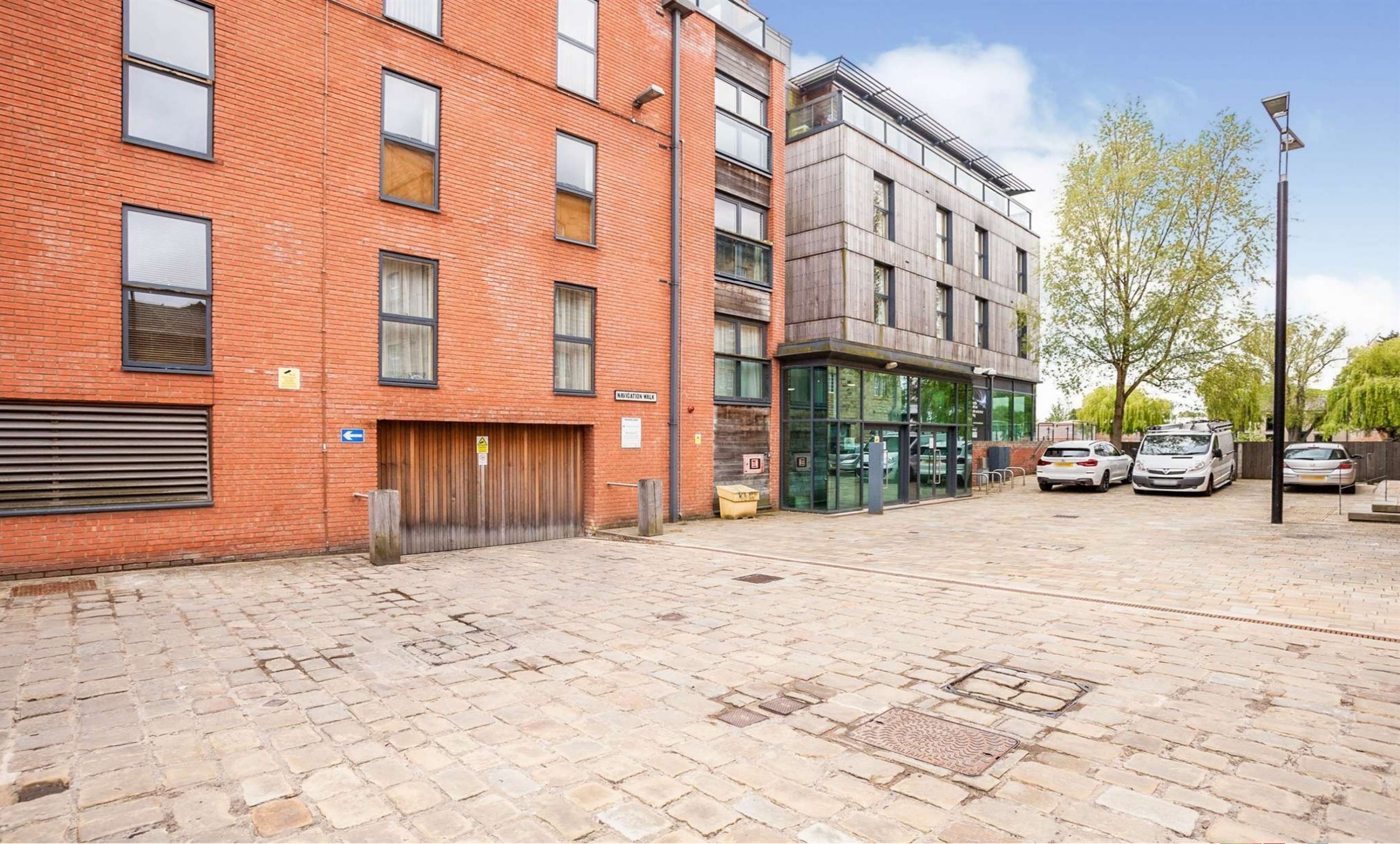
Navigation Walk, Wakefield WF1 5RD