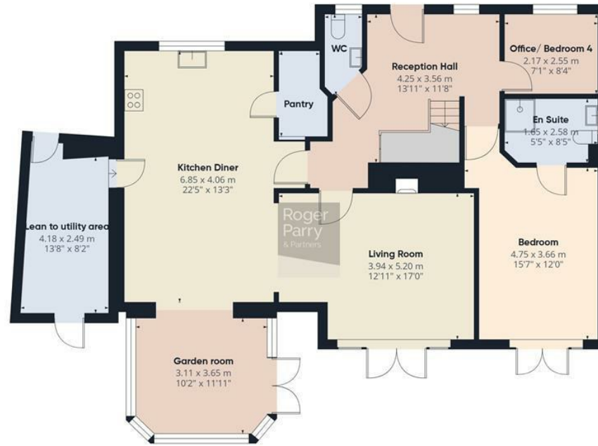
Ground floor Building 1