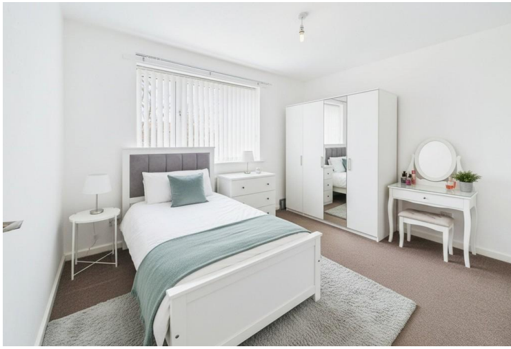
Virtually Staged - Bedroom Two