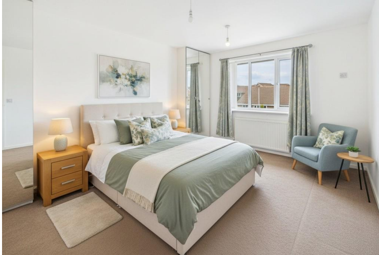
Virtually Staged - Bedroom One