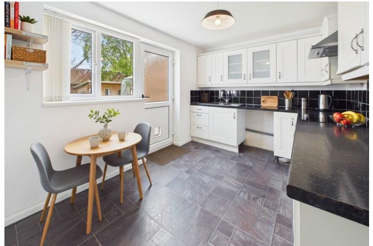
Virtually Staged - Kitchen