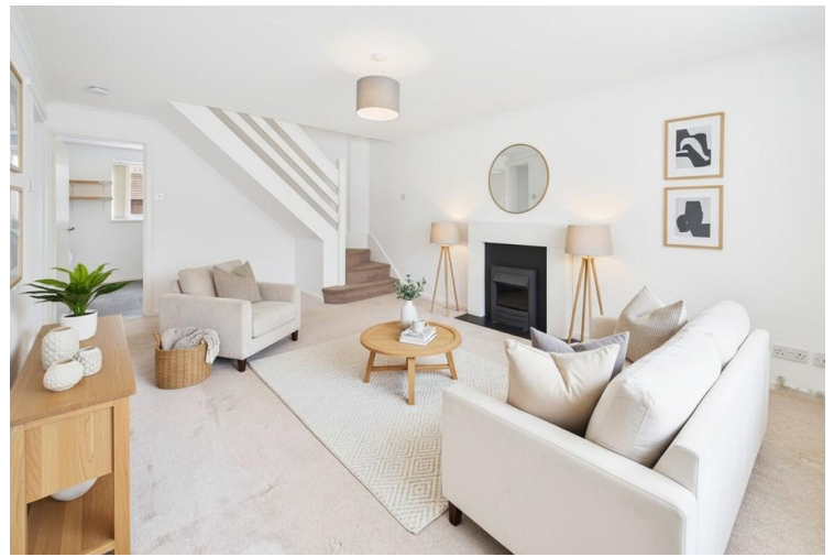
Virtually Staged - Lounge