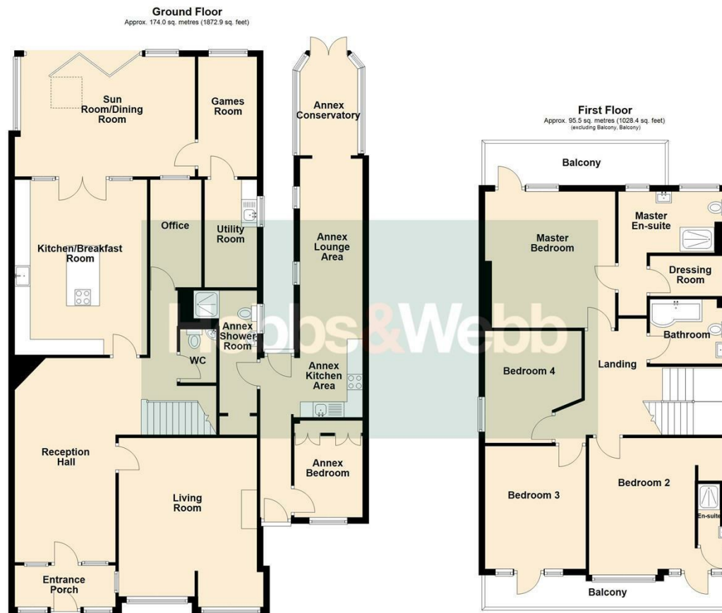
Ground Floor Approx. 174.0 sq. metres (1872.9 sq. feet)