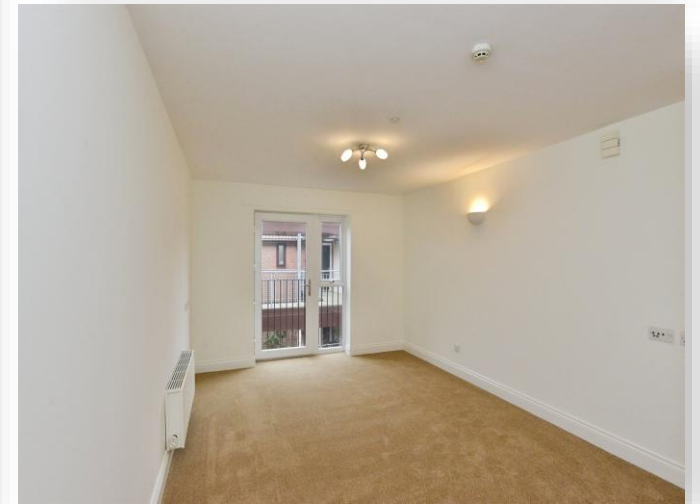
The Limes, Westbury Lane, Newport Pagnell, MK16 8FA