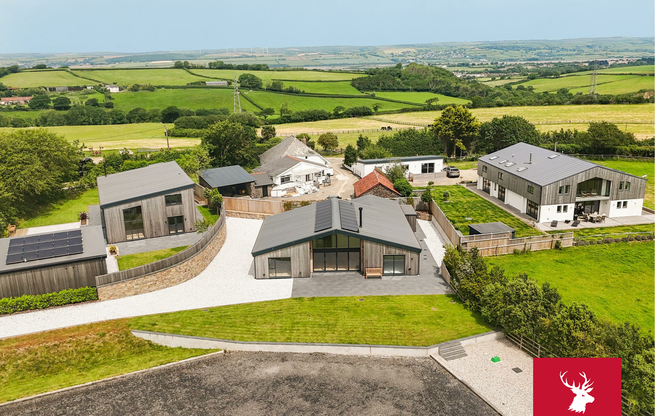
Little Knightacott Barn