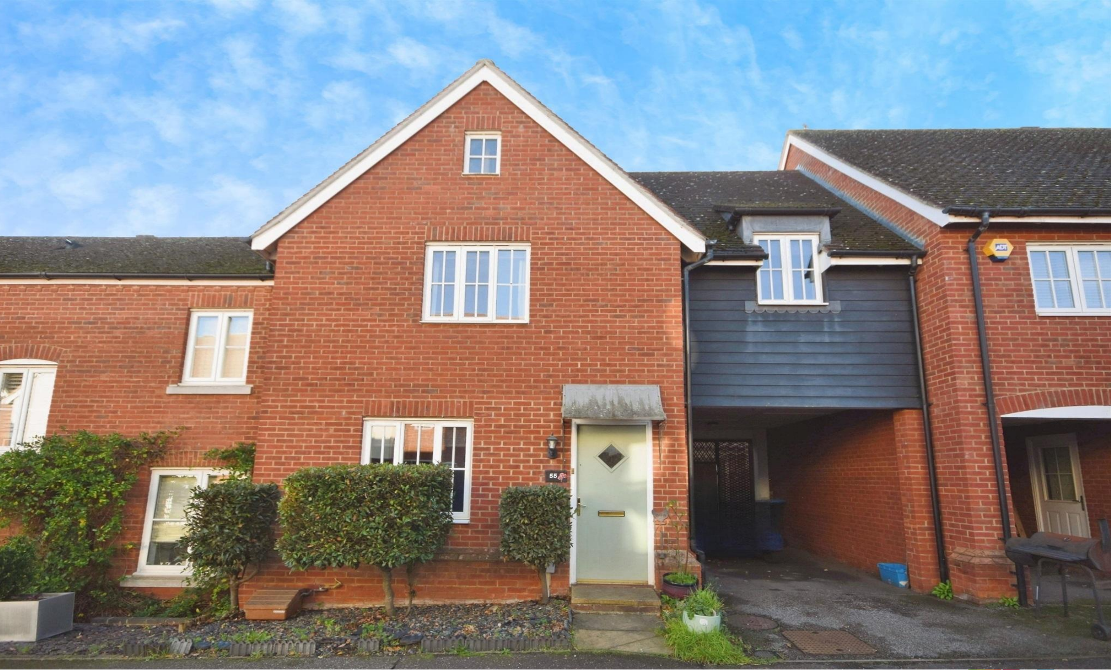
The Gables, Ongar, CM5 0GA