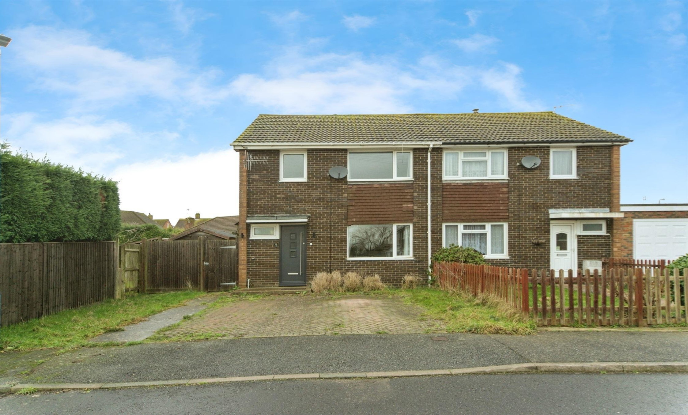
Pankhurst Close, Bexhill-On-Sea TN39 5DL