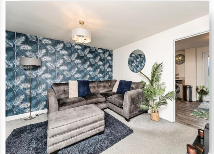
Paddock Rise, East Ardsley Wakefield WF3 2GF