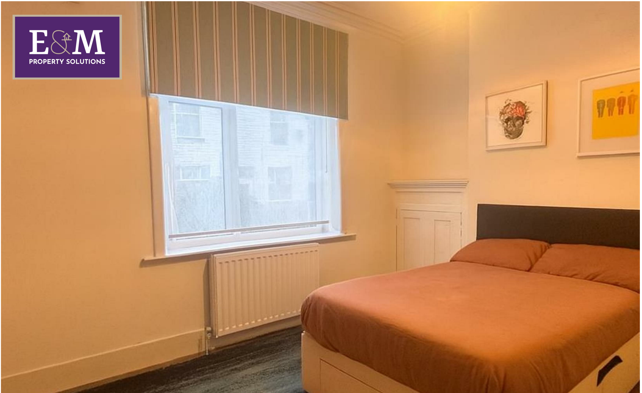
Room 1, 38 Colbran Street, Burnley, Lancashire, BB10 3DP £95 Per week