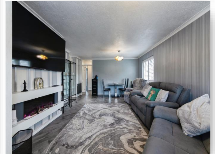
Prospect Lane, Solihull B91 1HN