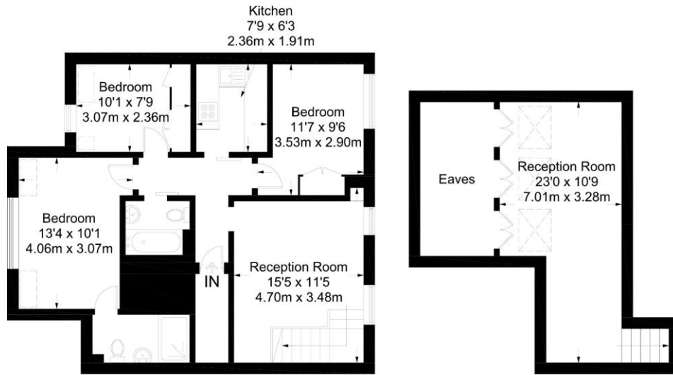
Third Floor 695 sq ft / 64.6 sq m