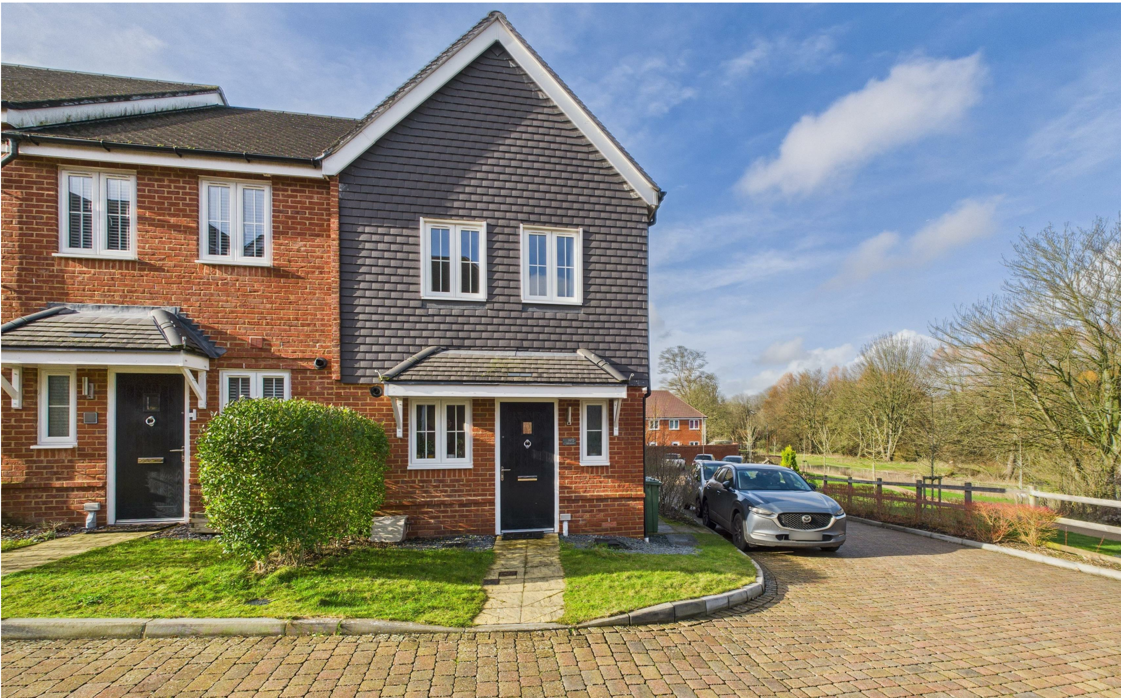
Mill Mead, Overton, Basingstoke, RG25 3FD