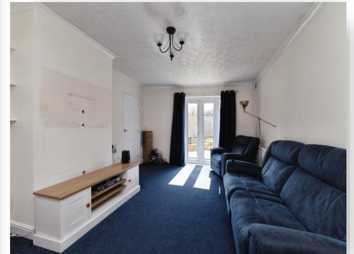
Kelvin Grove, Middlesbrough TS3 7RS