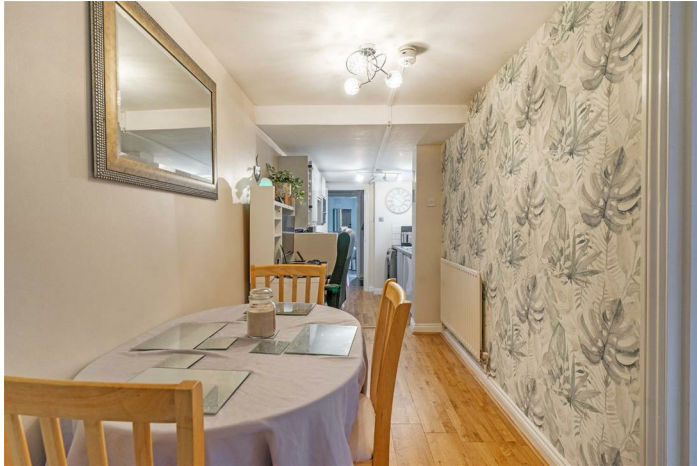
Council Tax Band: A