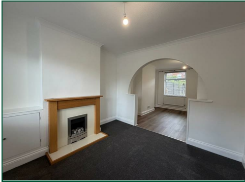
GROUND FLOOR 446 sq. ft. (41.4 sq.m.) approx.