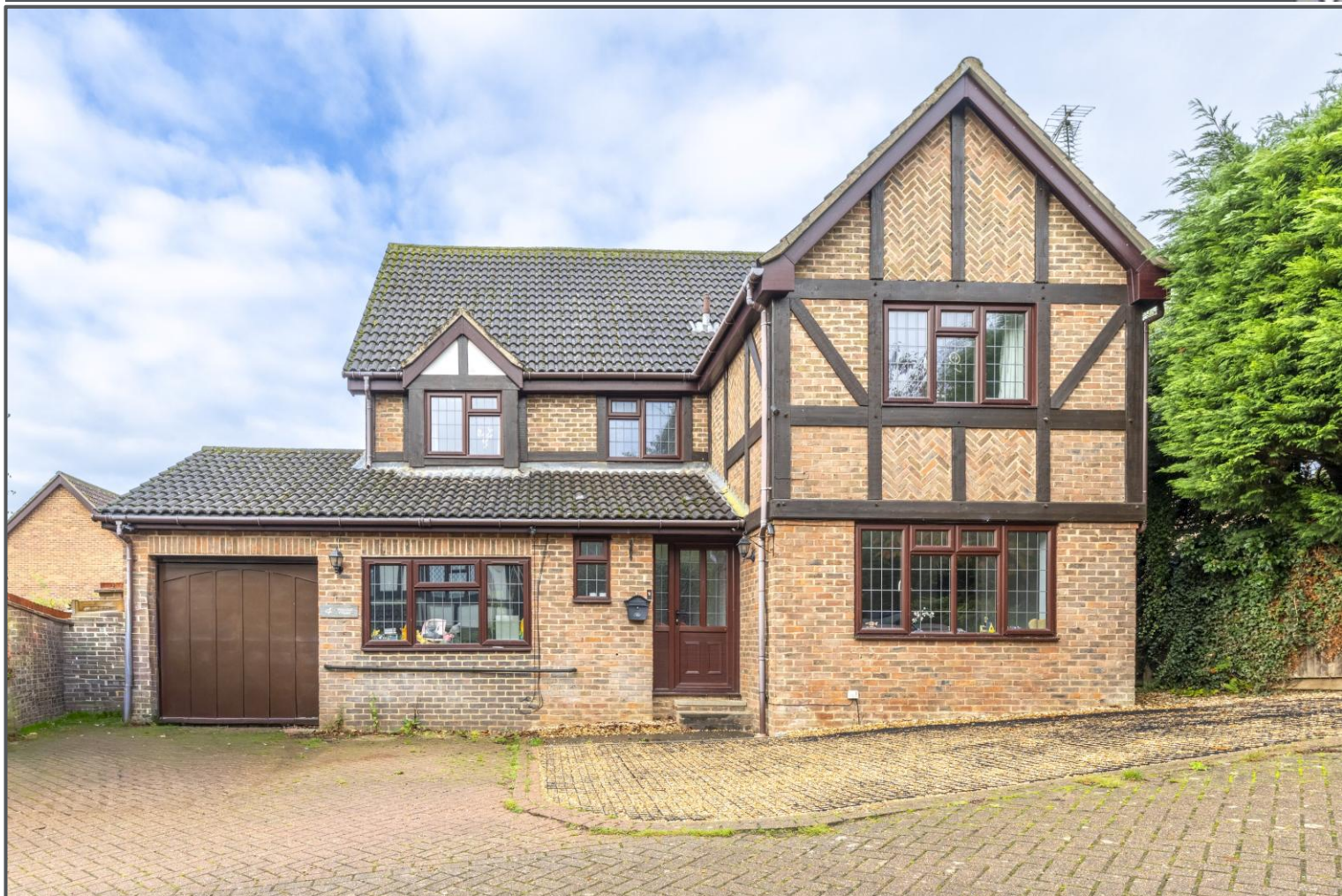
Walnut Close, Heathfield, TN21 8YL