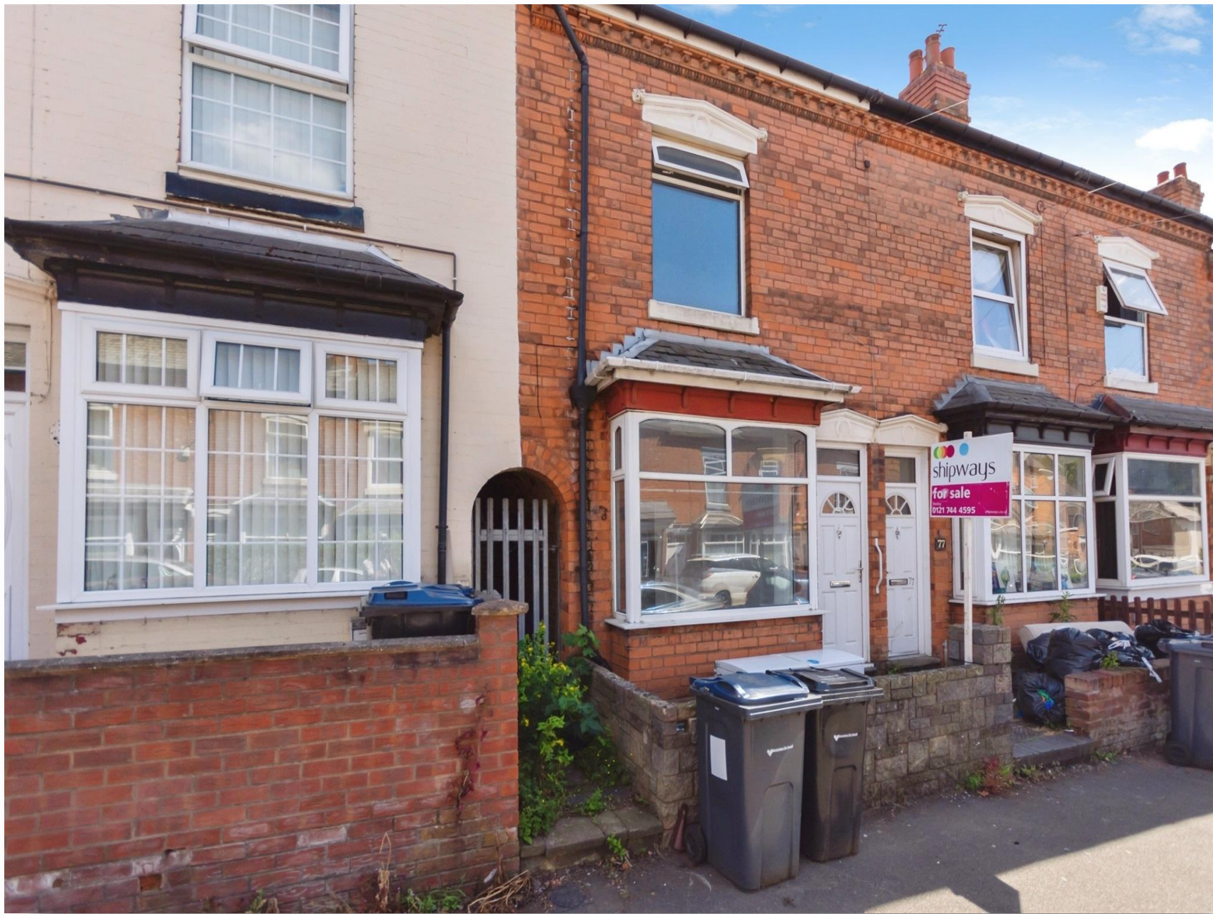
Manor Farm Road, Birmingham B11 2HT