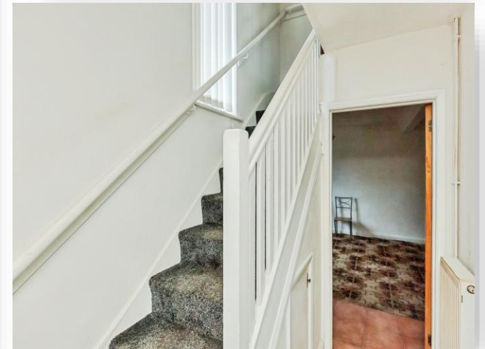
Whitworth Avenue, Corby NN17 1DL