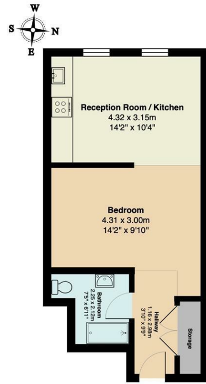
First Floor Total Area: 37.4 m 2 ... 402 ft 2 All measurements are approximate and for display purposes only

Kitchen / Dining / Reception Room 13'11" x 10'5"