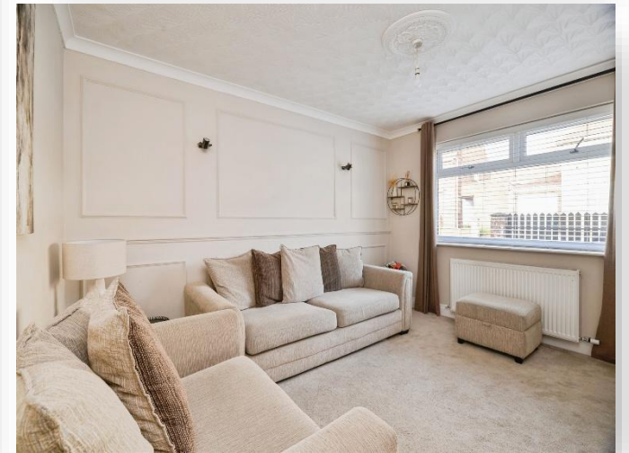
Avon Close, Thornaby Stockton-On-Tees TS17 8JE