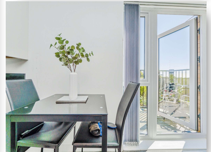
Rhodfa Crughywel, St. Mellons Cardiff CF3 0FJ