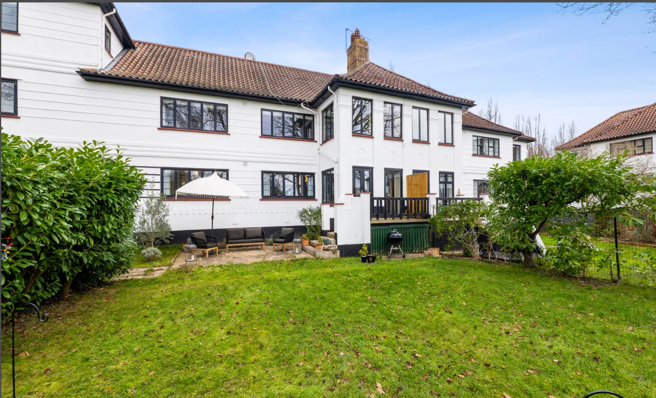
Christchurch Gardens, Christ Church Mount Epsom