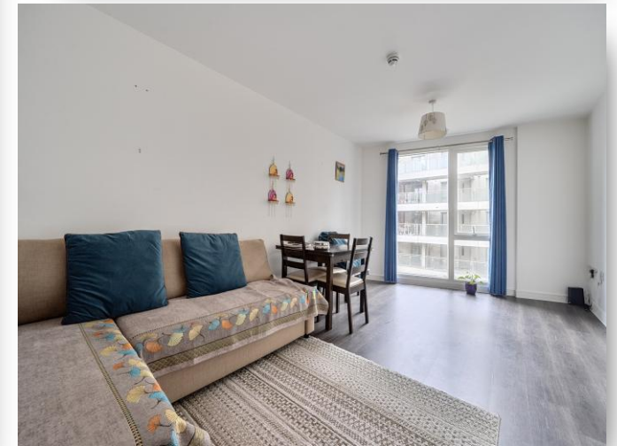
Flat 20 Lea House, 1 Kidwells Close, Maidenhead SL6 8FF