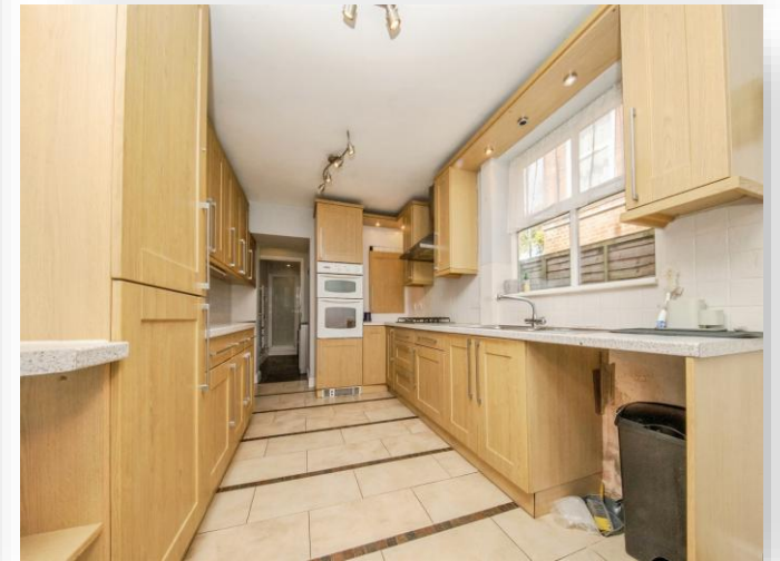
Cemetery Road, Ipswich, IP4 2HZ