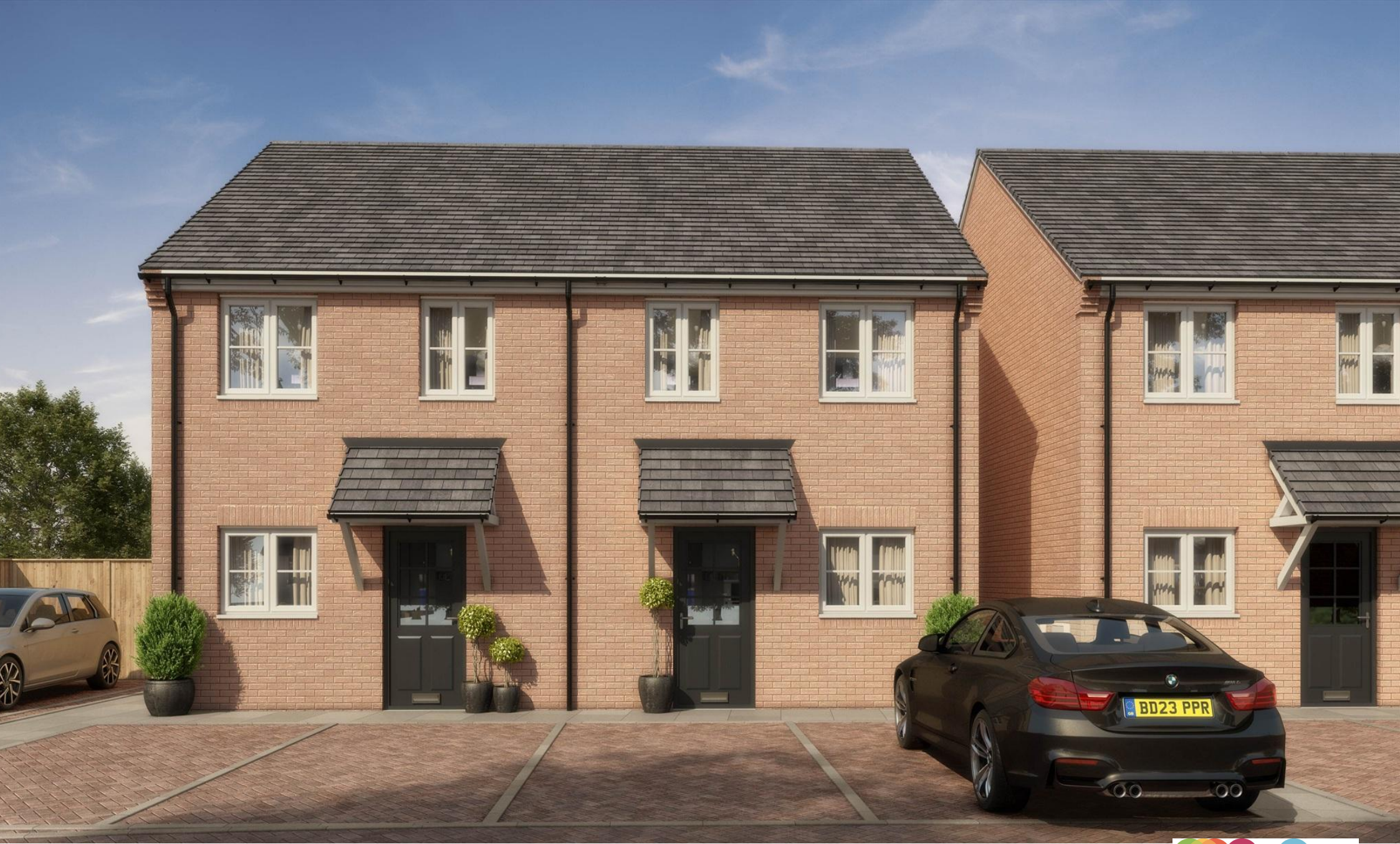
The Redwood Manthorpe Chase, Grantham NG31 8FH