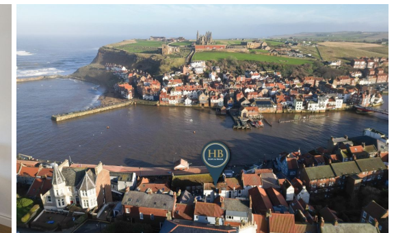
52 CLIFF STREET, WHITBY- 2 bed Cottage -£375,000