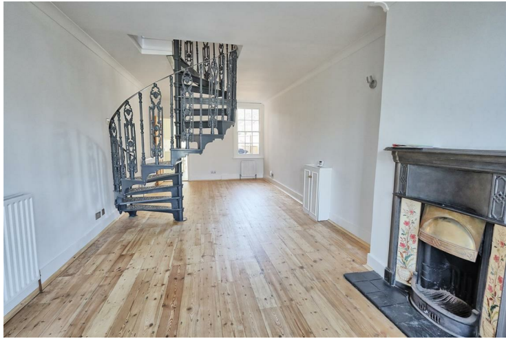
LIVING ROOM 22'7" x 11'3" (6.9 x 3.44)