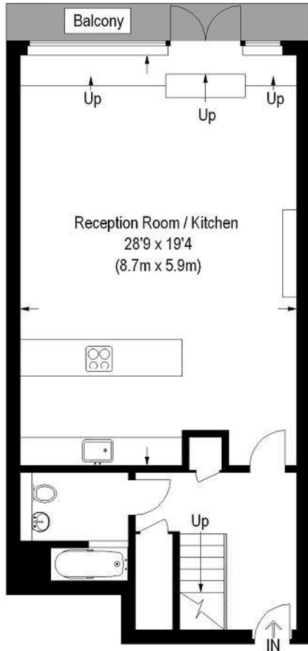
Third Floor Gross Internal Floor Area= (753 sq ft)

Approximate Gross Internal Area 1141 sq ft / 106 sq m