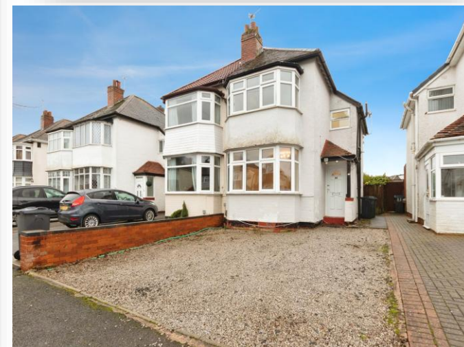
Barton Croft, Birmingham B28 0UY