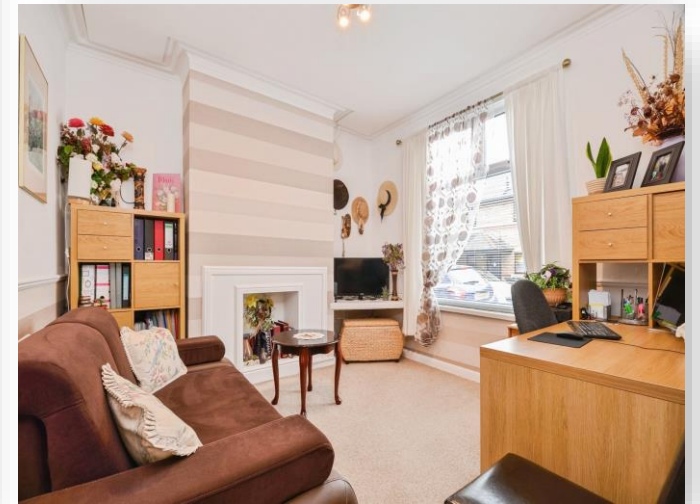
Wycombe Street, Darlington DL3 7DA