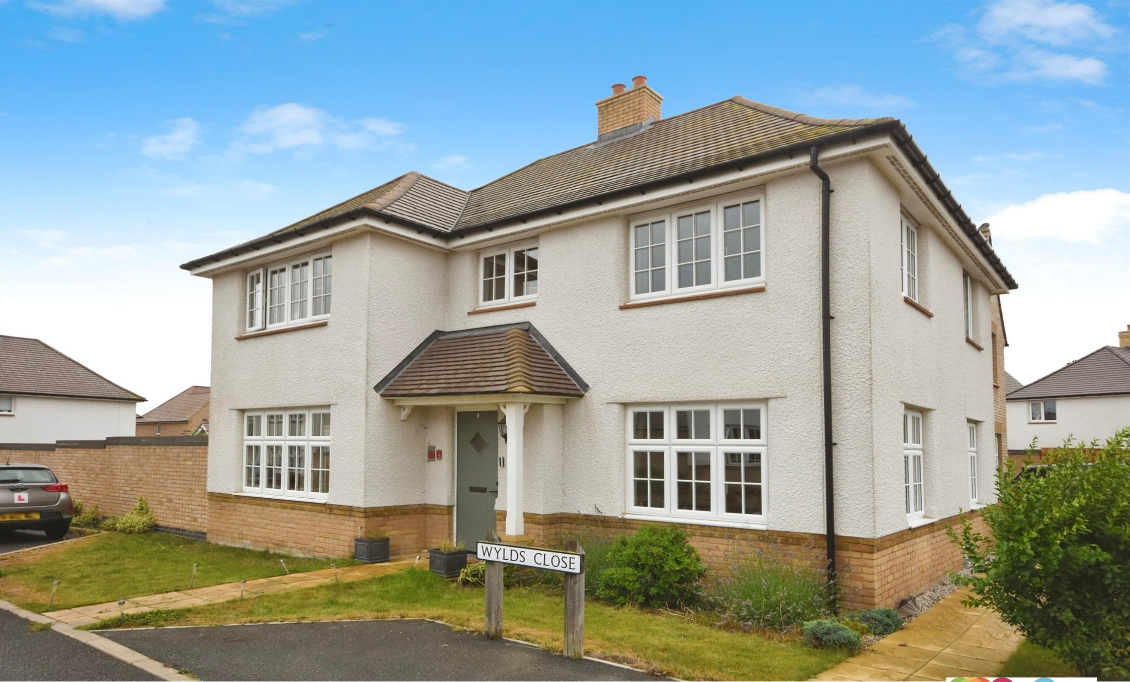
Wylds Close, Silver End, WITHAM, CM8 3TT