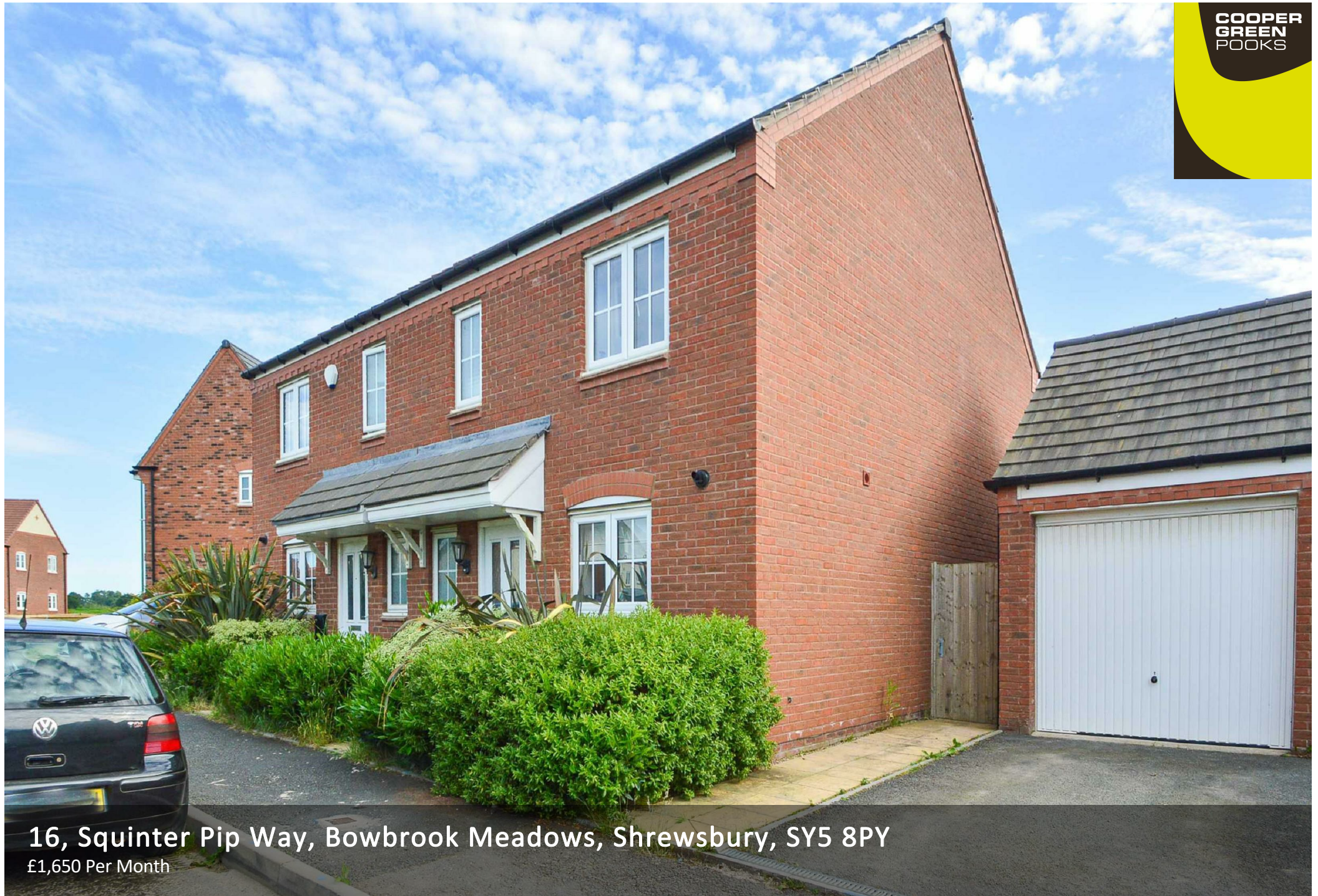
16, Squinter Pip Way, Bowbrook Meadows, Shrewsbury, SY5 8PY £1,650 Per Month