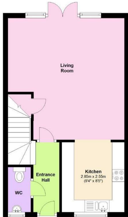
Ground Floor Approx. 37.5 sq. metres (404.1 sq. feet)