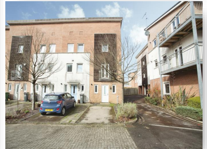
Burford Gardens, Cardiff, CF11 0AP