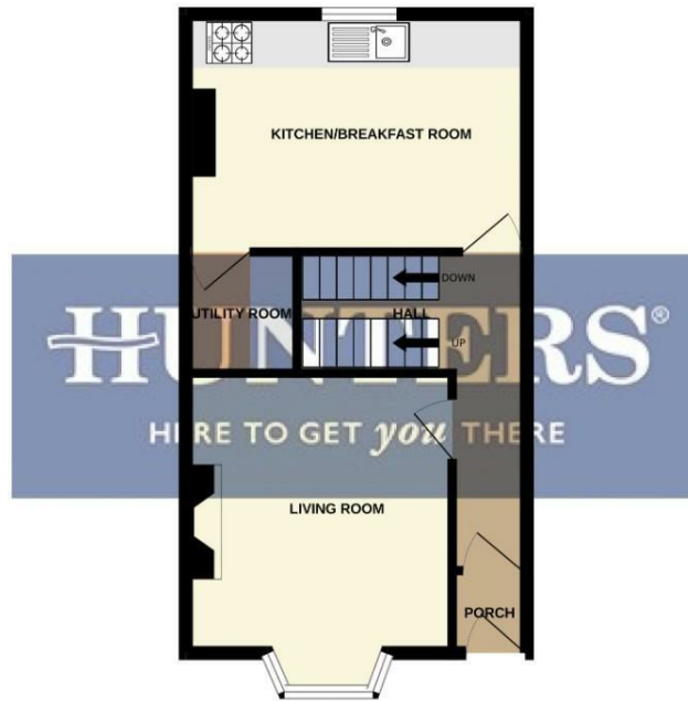
HALL FLOOR 386 sq.ft. (35.9 sq.m.) approx.